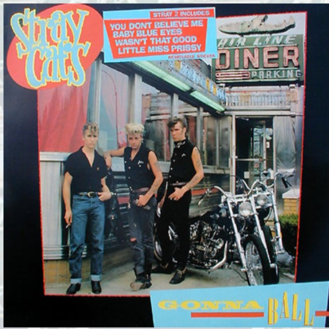
(above) front cover of 12" LP

As evidenced below, the LP's sleeve continued the Cats' tradition of great photography and striking graphics.