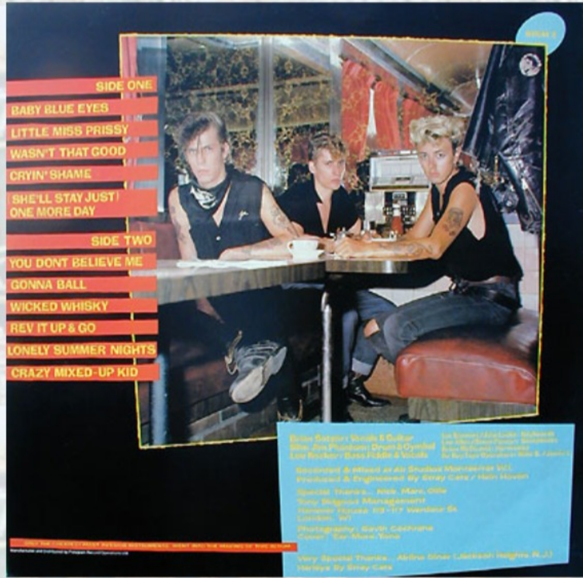
(above) back cover of 12" LP

What has long puzzled Stray Cats fans is the location of the brilliant diner featured on the album's packaging. As you can see below, the location of the Airline Diner is stated to be "Jackson Heights, New Jersey".